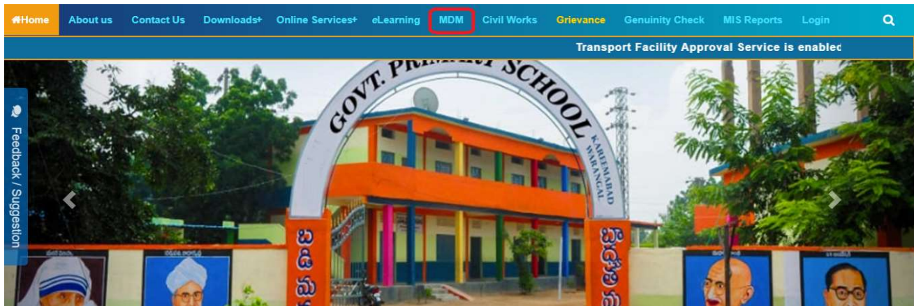
Figure 1:- Home page